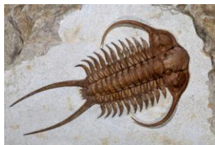
← Trilobite Fossil

The best type of index fossils are usually those of swimming or floating organisms that evolved quickly (and therefore existed only briefly ) and were widely distributed different geographic areas. Ammonites (marine mollusks) and trilobites (marine arthropods) are good index fossils.